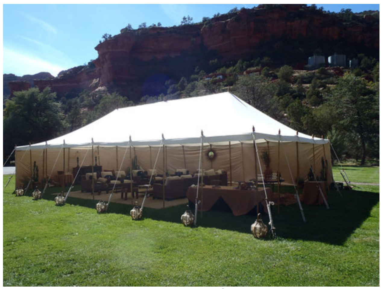
This is a luxury commercial tent produced in the U.S., but it is very much like the Bedouins use in the Middle East. The only major difference is the more sophisticated Bedouin tents have a flat roof.